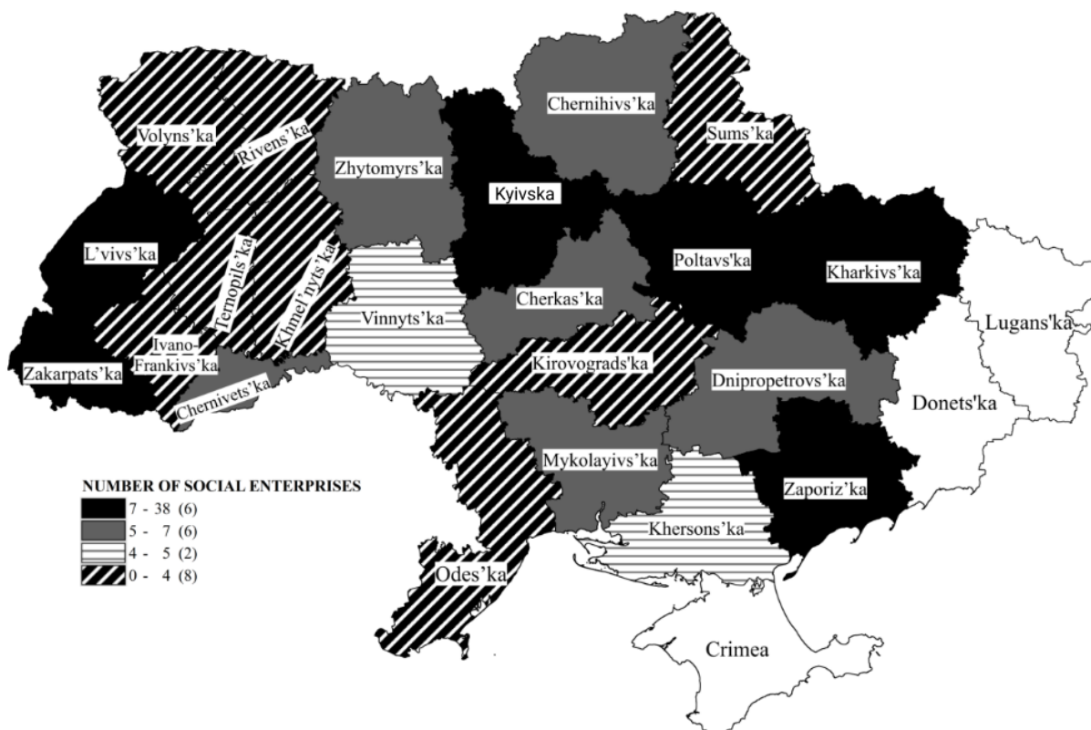
Fig. 3. Social enterprises in Ukraine in 2017

As shown in Fig. 3, the largest number of social enterprises in Ukraine is in the Kyivs'ka oblast - 38 enterprises, of which 30 are located in the city of Kyiv. The second highest number of social enterprises - L'vivs'ka oblast region (15 companies), and the third - Poltav'ska oblast (9 companies). Mostly, social enterprises are registered in city areas, there are 114 enterprises, 4 - in urban areas, 24 - in villages. It should be noted that no social enterprise was created in Rivens'ka oblast during 2008-2017. The most common forms of social enterprises in Ukraine are an individual person-entrepreneur - 37 enterprises, a private company - 23 and a non-governmental organization - 20 enterprises. Most of social enterprises in Ukraine are engaged in the cultivation and sale of agricultural products (e.g. berries, mushrooms, dairy products, etc.) - 23 enterprises. In second place - enterprises engaged in vocational, medical and social rehabilitation persons with disabilities (21 enterprises).